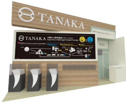
Artist's impression of booth